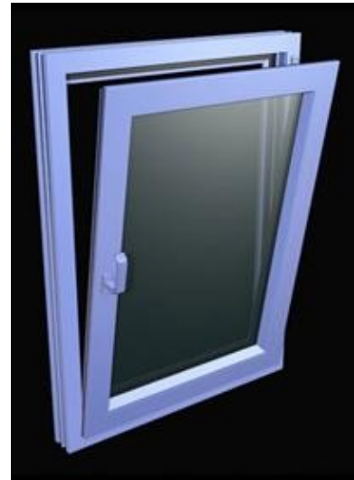
Tilt position for ventilation